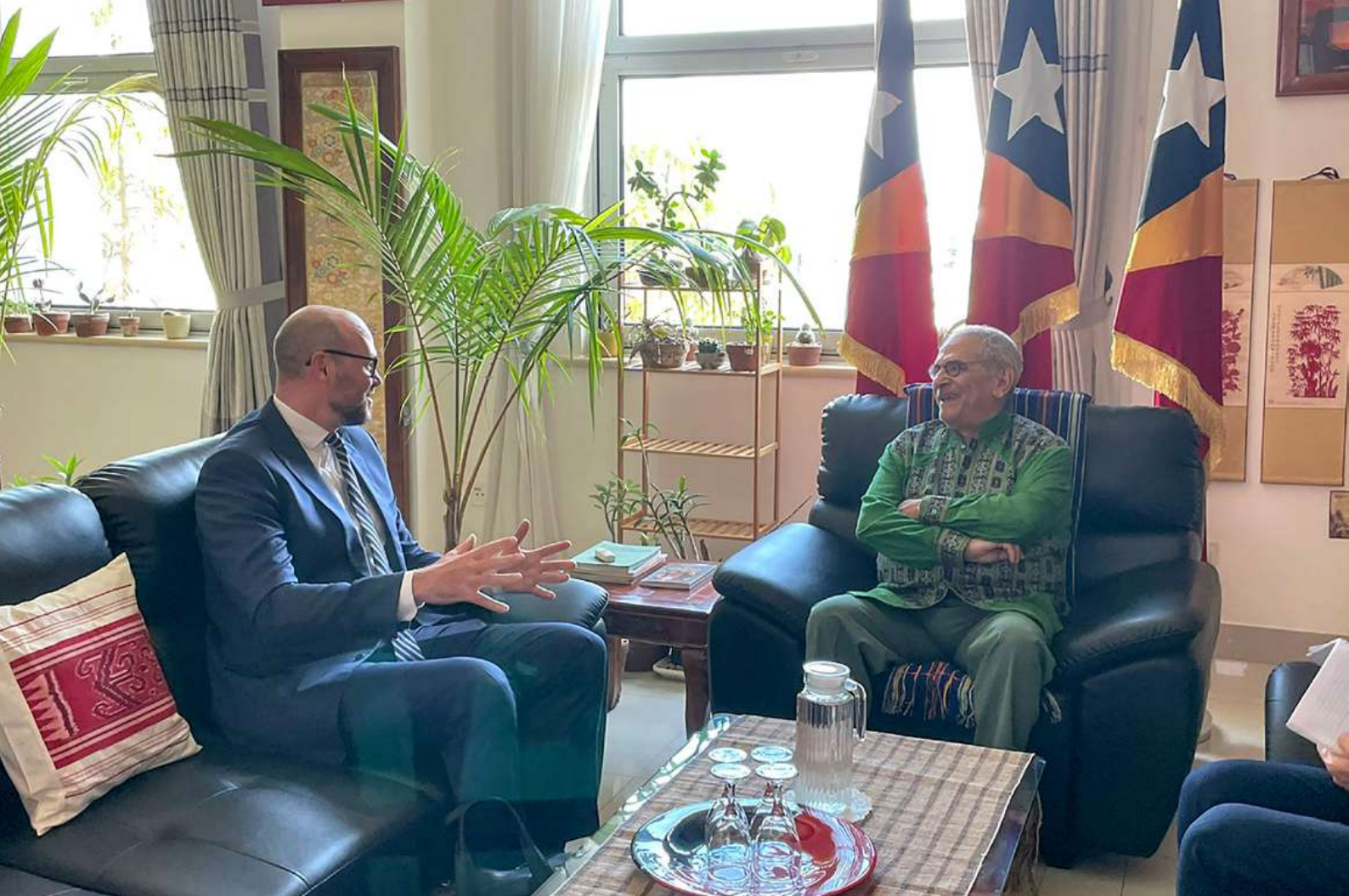
▲ Former Australian Ambassador to ASEAN, H.E. Will Nankervis, meets with the President of Timor-Leste, H.E José Ramos-Horta, 13 December 2023.