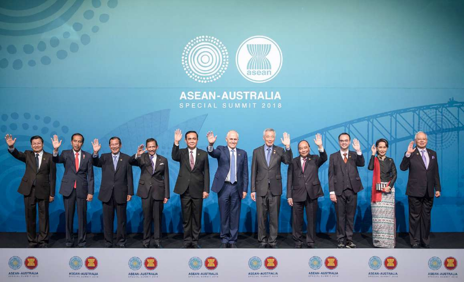
▲ Australia's 29th Prime Minister, Malcolm Turnbull AC, and ASEAN Leaders at the ASEAN-Australia Special Summit in Sydney, 17–18 March 2018.

The multilateral and bilateral machinery that generates the ongoing momentum for ASEAN-Australia relations is itself a significant achievement, and it is on the basis that this machinery is working well that further ambitions can be achieved. In developing this report, the assessment from stakeholders in Australia and across ASEAN was largely positive. Many explained that the expansion of the Australian Mission to ASEAN to implement the Comprehensive Strategic Partnership and the bolstering of its Jakarta-based team has improved Australia's capacity to engage effectively, promptly and at the requisite scale with key ASEAN stakeholders.