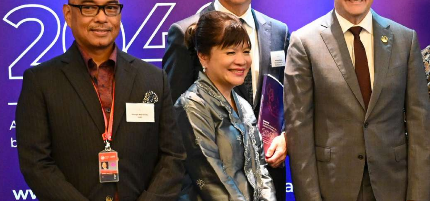
▲ The Hon Anthony Albanese, Prime Minister of Australia, Senator the Hon Penny Wong, Minister for Foreign Affairs, Australia, Mr. Nicholas Moore, Australia's Special Envoy for Southeast Asia, and Indonesian dignitaries, including Mr. Asjad Rasjid, Chairman of the Indonesian Chamber of Commerce and Industry, at the launch of Invested: Southeast Asia Economic Strategy to 2040 in Jakarta, 6 September 2023.