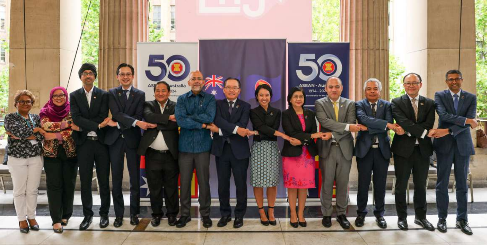
▲ Australia hosts ASEAN officials for the 36th ASEAN Australia Forum in Melbourne, ahead of the ASEAN-Australia Special Summit in 2024, 5-6 February 2024.

The reality, according to one ASEAN emerging leader, is that “we have a very positive sense of Australia, but the Australia-ASEAN relationship isn’t something that immediately comes to mind”. The reason for this, he suggests, is that so much geopolitical discussion is framed around the United States and China, and so there is simply less space to consider some of the other important relationships that help to support Southeast Asia’s success, such as the enduring ASEAN-Australia partnership. In this context, he says that the fact Australia is “showing up is very important for creating networks”.