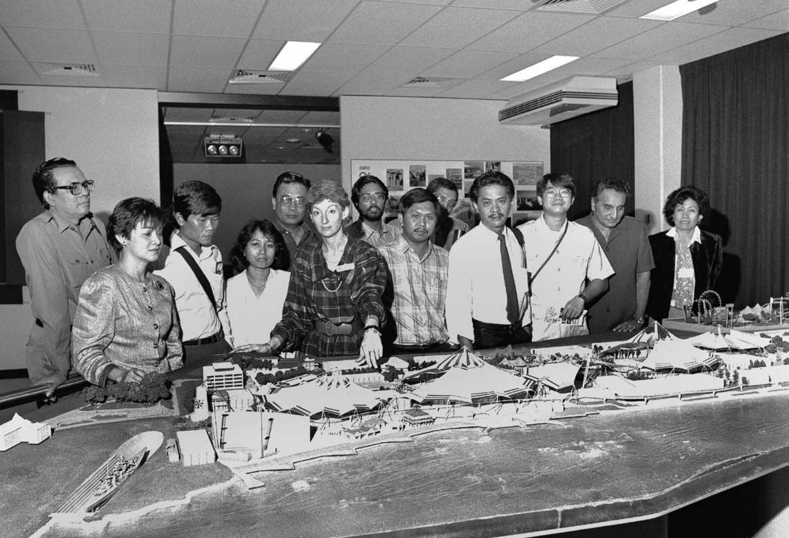
▲ ASEAN journalists visit the World Expo '88 site, 1987. © Image courtesy of the National Archives of Australia. NAA: A6180, 1/5/87/3.