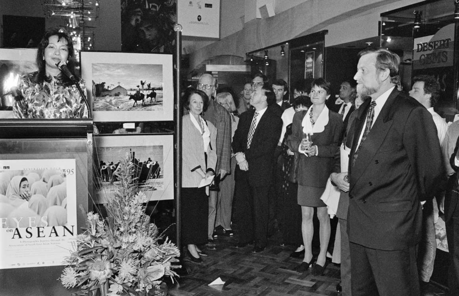
▲ Australian Foreign Minister, Gareth Evans, opens Eyes on ASEAN exhibition in Melbourne, 1994. © Image courtesy of the National Archives of Australia. NAA: A6180, 18/10/94/10.

The COVID-19 global pandemic brought a temporary pause to much of the easy flow of people-to-people engagement between Australia and ASEAN. For long periods from 2020-2022, national and local borders impeded the movement of travellers and business people and required new approaches and systems to ensure health and economic security. Many Australians and Southeast Asians could not enjoy their usual range of easy linkages to each other. It was also a period of significant technological innovation, with some ASEAN countries leading the world in their pandemic responses, managing complex social and humanitarian issues, while maintaining commercial linkages.